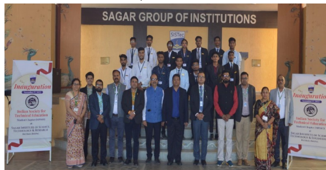
Dignitaries during the inauguration of ISTE Section Annual Convention.