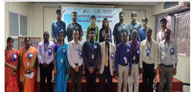
Dignitaries and faculties during the inauguration of ISTE Students Chapter.