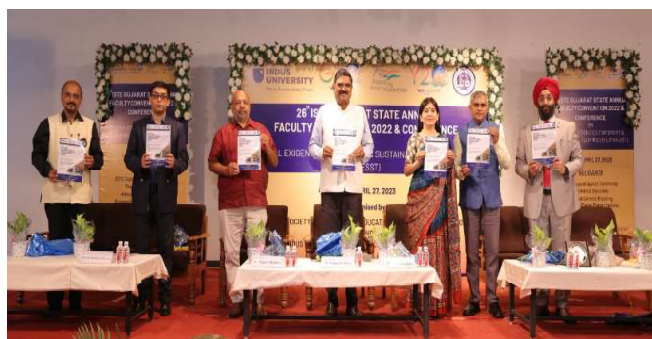
Release of Convention Souvenir by the Chief Guest and the dignitaries on the dias.

The State Awards were also distributed during the inaugural function by the dignitaries.