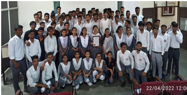
Students during the inauguration of ISTE Students Chapter.