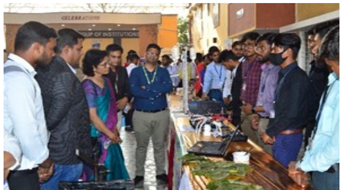
Project Exhibition at a glance.