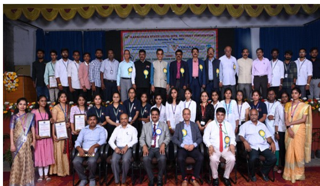
Eminent dignitaries, Faculty, Students and Awardees during the Convention.