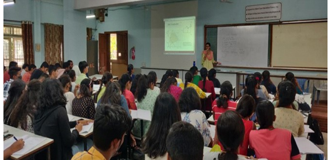
Expert delivering the lecture.