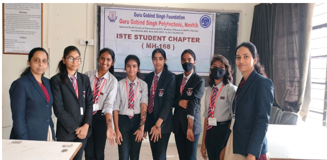
Students during the competitions.