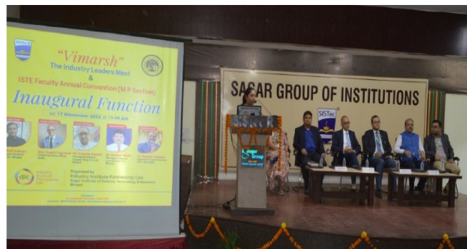
Dignitaries during the inauguration of Industry Leaders Meet.