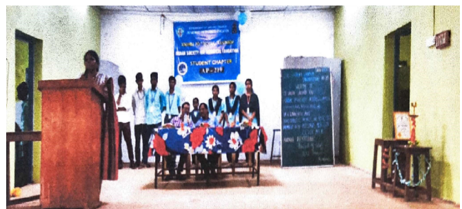
Inauguration of ISTE Students Chapter.

Note : ISTE does not assume any responsibility for the information furnished and views expressed by the individuals.