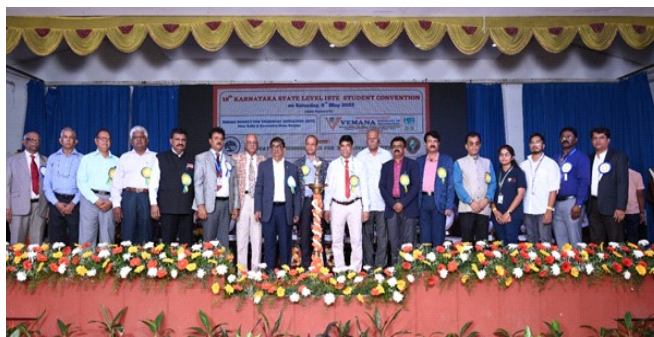
Dignitaries on the dias during the inauguration of the Convention.