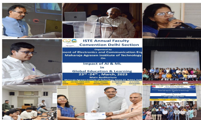
Dignitaries during the inauguration of ISTE Delhi Section Faculty Convention.