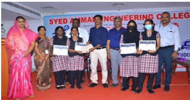
Prize distribution during the function.

Only sharp and well focussed photographs with ISTE Logo and Banner in the background shall be considered for publication.