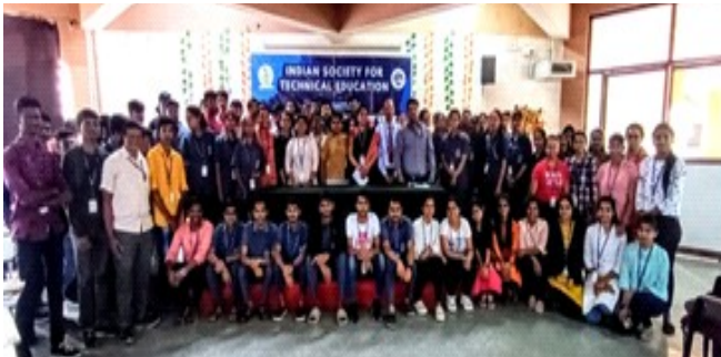
Student participants during the seminar.