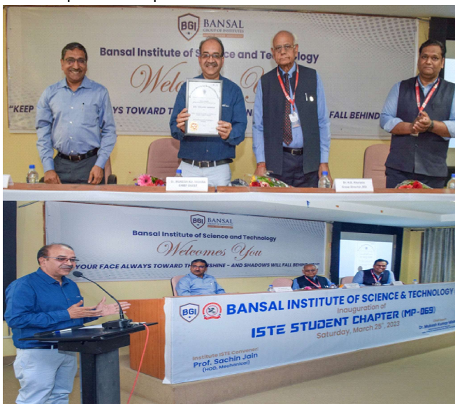
Dignitaries on the dias during the inauguration of ISTE Students Chapter.