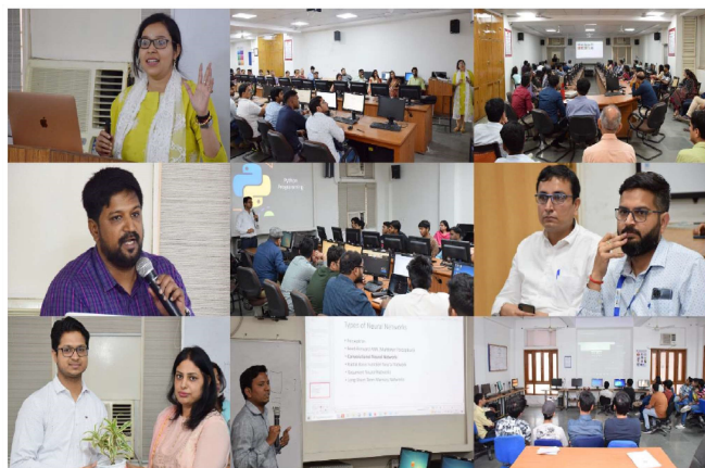
Glimpses of Faculty Convention and Conference at a glance