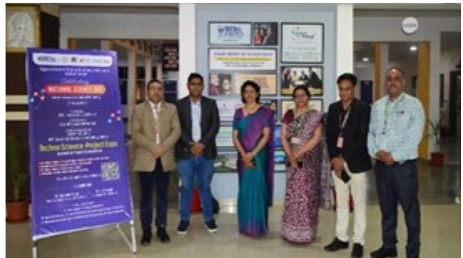
Dignitaries during the celebration of National Science Day.