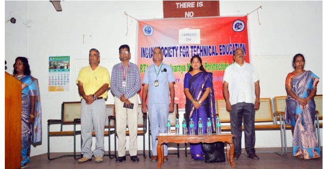
Dignitaries on the dias during the programme.