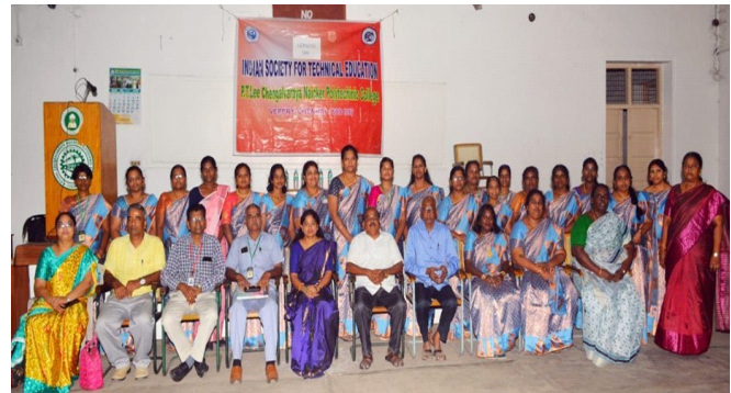
Dignitaries on the dias during the programme.